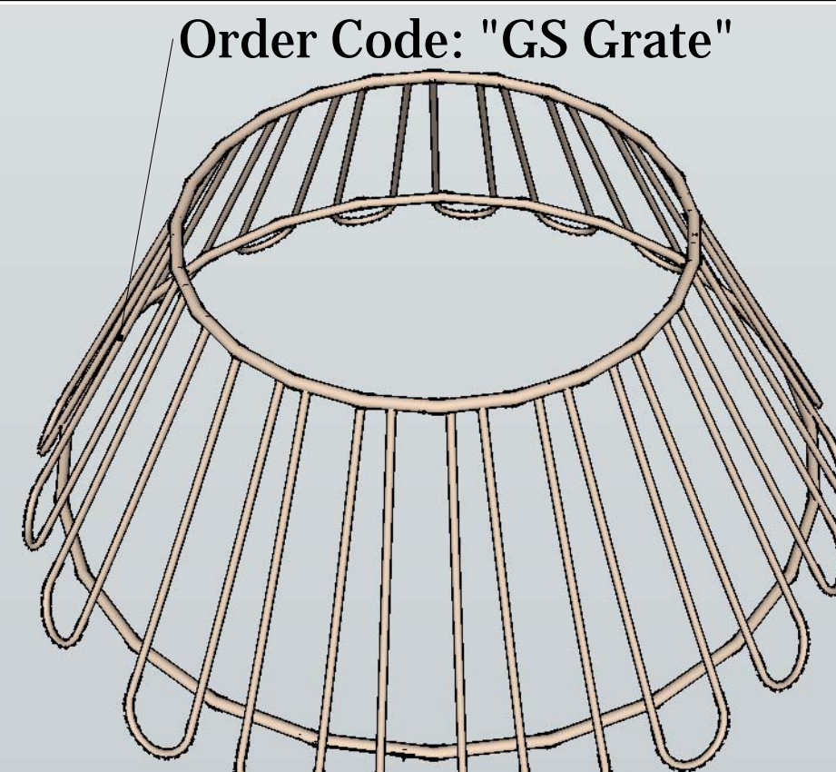
Order Code: "GS Grate"

The Gutta Sump System is a unique use of a shape that allows box gutter discharges to flow into the downpipe utilizing the Coriolis effect and disposes in 100mm DP at >80l/s